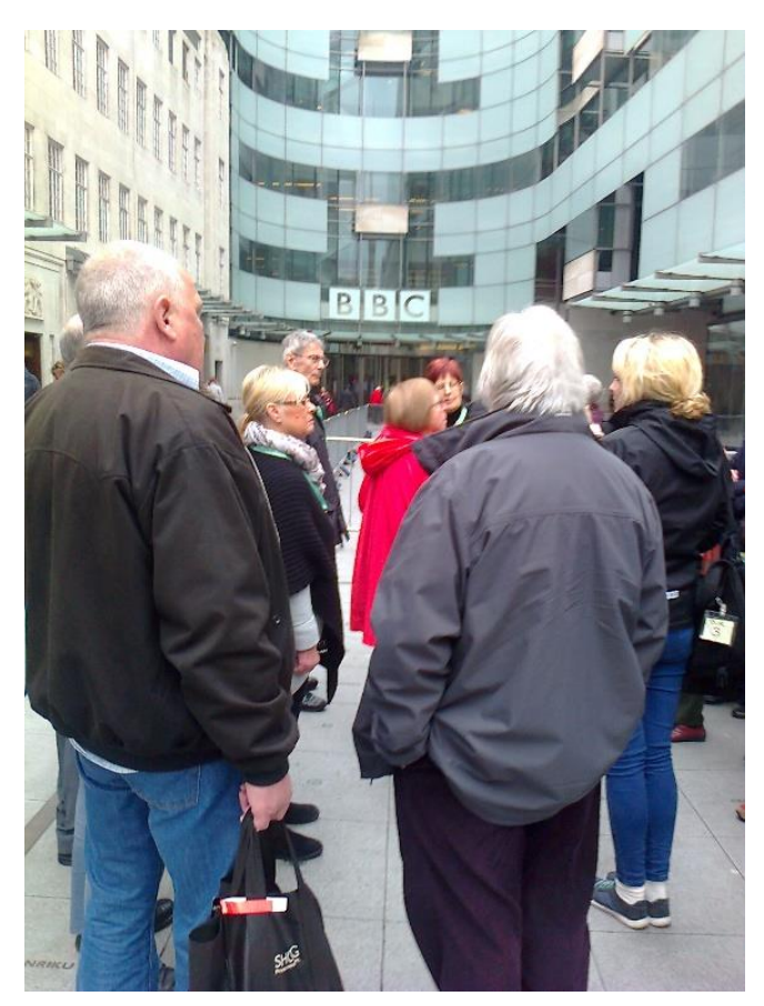
1. Outside the new BBC