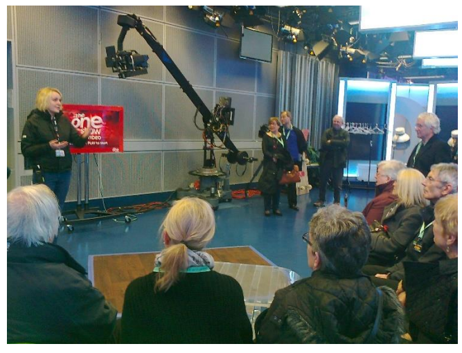
The One Show studio

The One Show studio was a shock to all – it is tiny with virtually a settee and a coffee table and just enough room for the cameras. The back drop is the pavement outside the BBC which at times affords an extension to the studio for guests such as music groups etc. who would not by any stretch of the imagination fit into the studio.